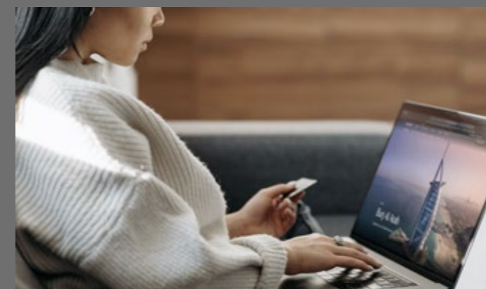
Pay with Points